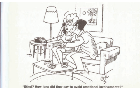
"Ethel? How long did they say to avoid emotional involvements?"